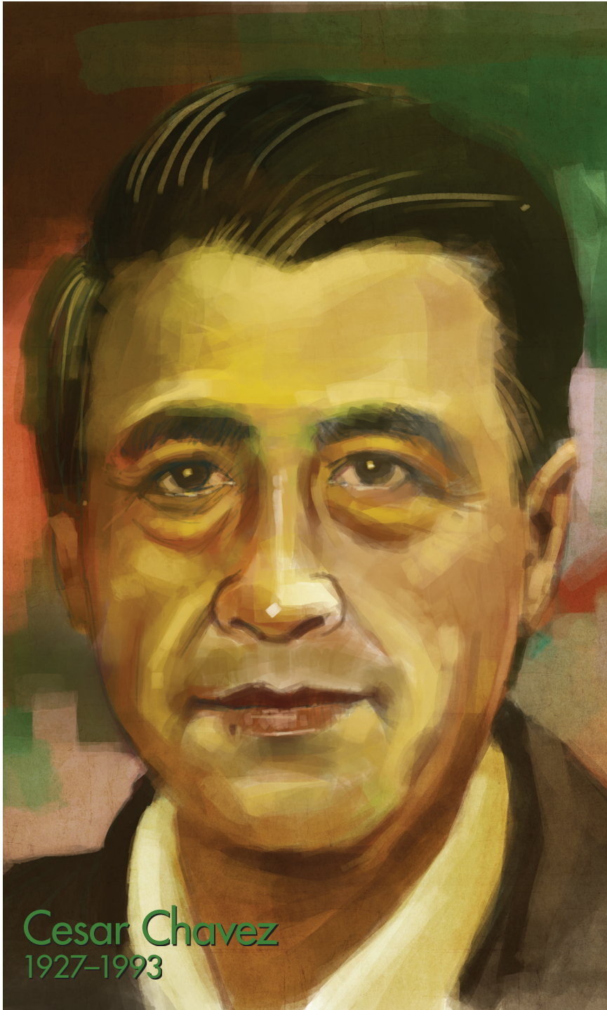
Cesar Chavez 1927-1993